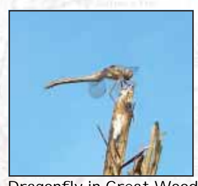
Dragonfly in Great Wood

Turn left and follow Marley Lane back towards Battle, taking care on the first section where there is no footway. I mmediately after crossing the railway, turn left and follow the narrow, surfaced path beside the railway, to reach Battle Station and the end of the walk.