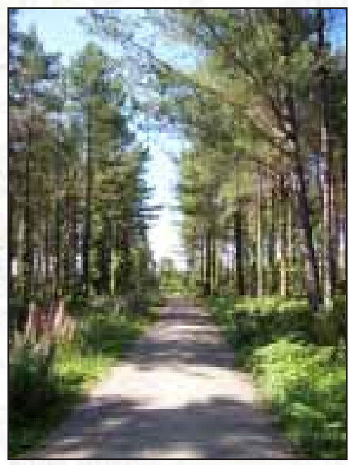
A track through Great Wood